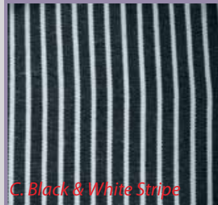
C. Black & White Stripe